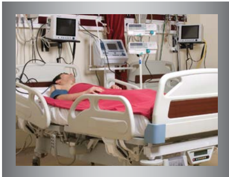
Medical-Grade (UL 60601-1 or UL 1363A) Power Strips Required