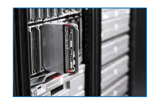
High-density loads like blade servers and PoE switches can create hot spots that traditional perimeter cooling systems have trouble addressing.

For the last 40 years, the primary method of data center cooling has been to use a perimeter computer room air conditioner (CRAC) to cool the entire room. The cool air supplied in this room-based approach may be unrestricted by ducts, vents or dampers. Or, it may be partially constrained by having CRAC units distribute cold air under a raised floor with perforated tiles or vents and removing warmer exhaust air through an overhead return plenum.