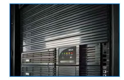
Simple steps like installing blanking panels in unused rack spaces can help prevent warm air from recirculating and improve cooling efficiency.

If you continue to have heat-related issues after implementing these best practices, it's time to consider close-coupled cooling solutions. Based on the premise that one of the most effective ways to increase cooling