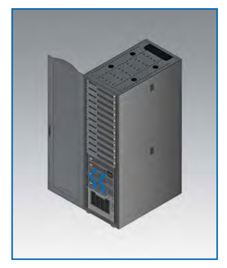
A rack-mounted air conditioning unit operates from the top or bottom of a rack enclosure.

A hybrid rack-mounted cooling and ducted rack solution is recommended when the data center has a dropped ceiling, scattered high density racks or an uneven number of rack rows. It can also be effective when rack rows are not equal in length, making hot aisle/cold aisle arrangements impractical. Like portable options, rack-mounted air conditioning units should provide remote management capability.