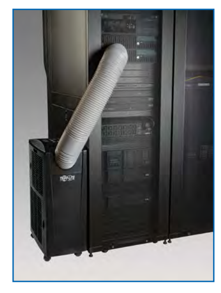
Close-coupled cooling solutions increase cooling efficiency and performance by moving air conditioning closer to your equipment.