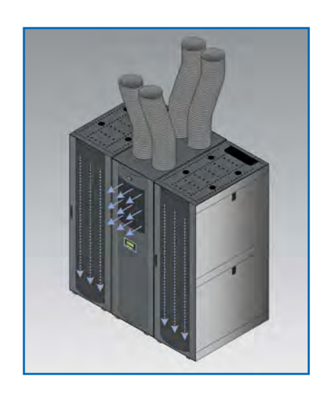
A row-based air conditioning unit resides in the rack row, supplying cold air high in the cold aisle.

Row-based cooling also improves the efficiency of hot-aisle/cold-aisle rack layouts. It removes hot air from the hot aisle and supplies cold air high in the cold aisle, promoting top to bottom temperature uniformity.