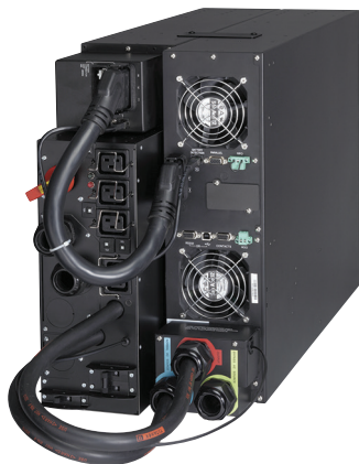
9PX 11 kVA with maintenance bypass