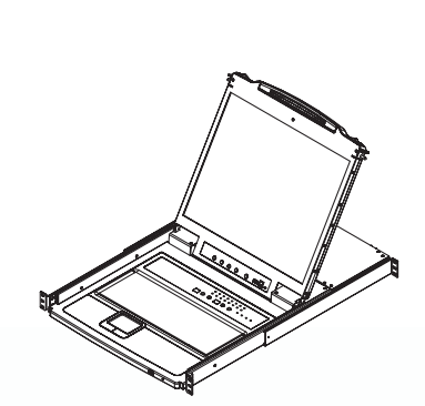
B020-U16-19-IP 1U Rack Console with 16-Port KVM Switch and Remote Access