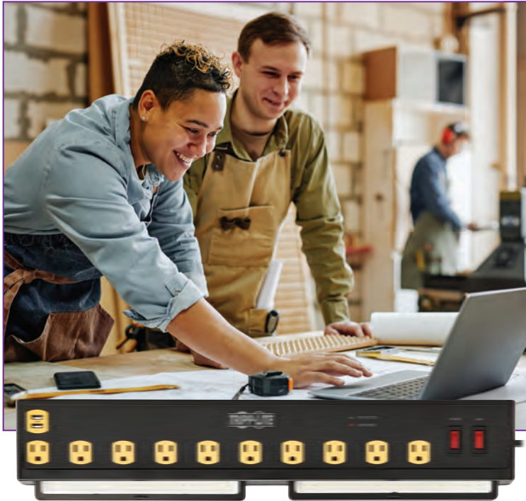
Surge protectors can accommodate 10 AC-powered devices and two USB devices at once.