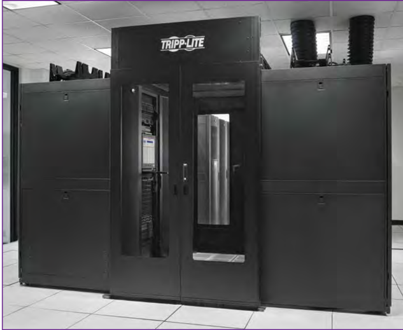
A fully assembled aisle containment system improves cooling efficiency while keeping equipment accessible.