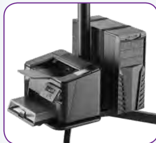
Shelves accommodate a monitor, keyboard, CPU and printer to create an all-in-one mobile desk.

Tripp Lite's new workstations combine the freedom of mobility with the convenience of height adjustment. The workstations roll easily from room to room on swivel casters and are perfect for applications where a stationary desk is not practical.