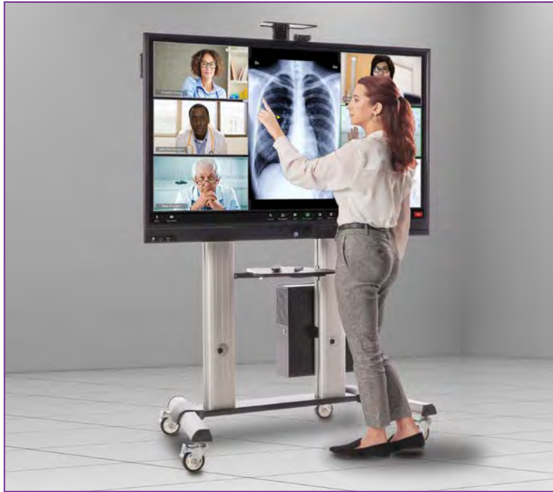
Tripp Lite's Mobile Interactive Display integrates a 4K touchscreen, HD webcam and wireless networking to connect local and remote teams.