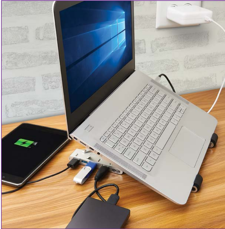
The U460-ST4-4A-C USB-C hub keeps all your devices charged and connected without adding cable clutter.