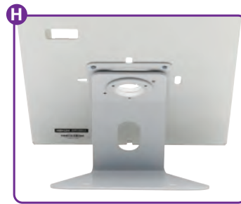
*DMTB911 comes with backstand installed. Backstand must be removed to attach VESA arm.