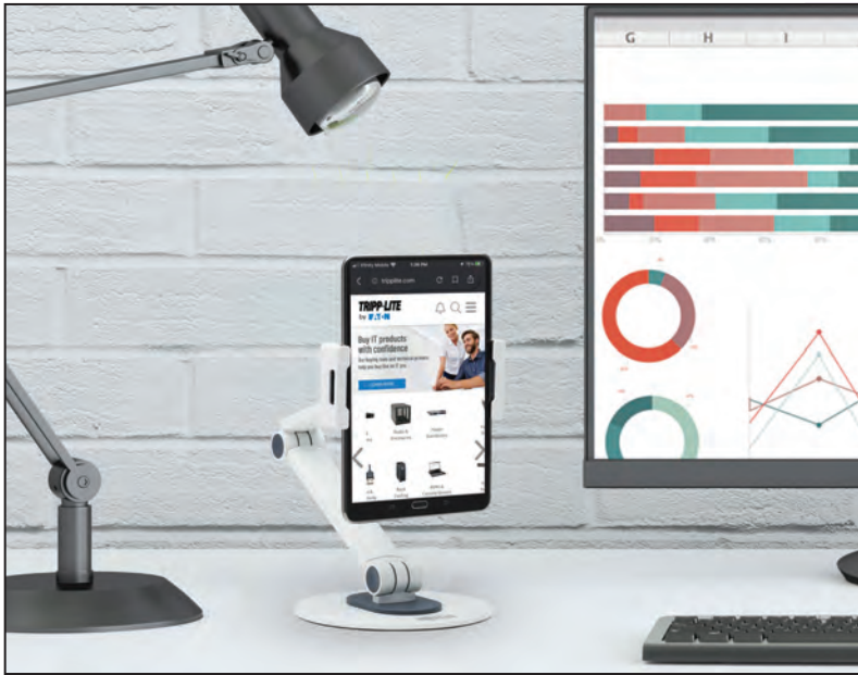
Tablet mounts can quickly install tablets in optimal locations.