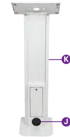
Model: DMTBS13 (back)