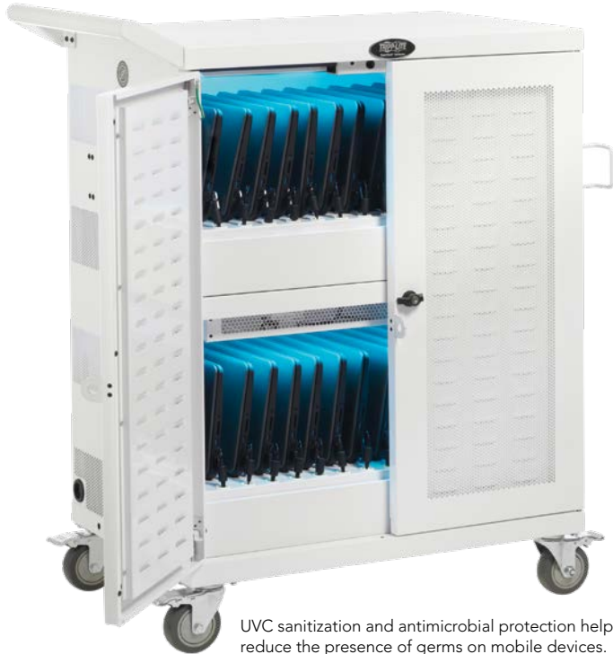
UVC sanitization and antimicrobial protection help reduce the presence of germs on mobile devices.