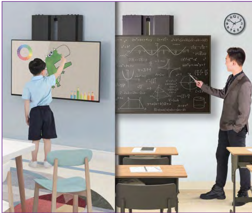
Easily raise and lower height-adjustable wall mounts to accommodate users of all sizes.