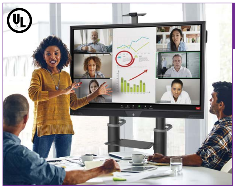
UL certified, antimicrobial carts help move even the largest displays easily.