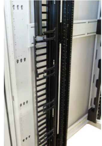
Vertical Cable Manager installed in the rear of a Paramount Enclosure.