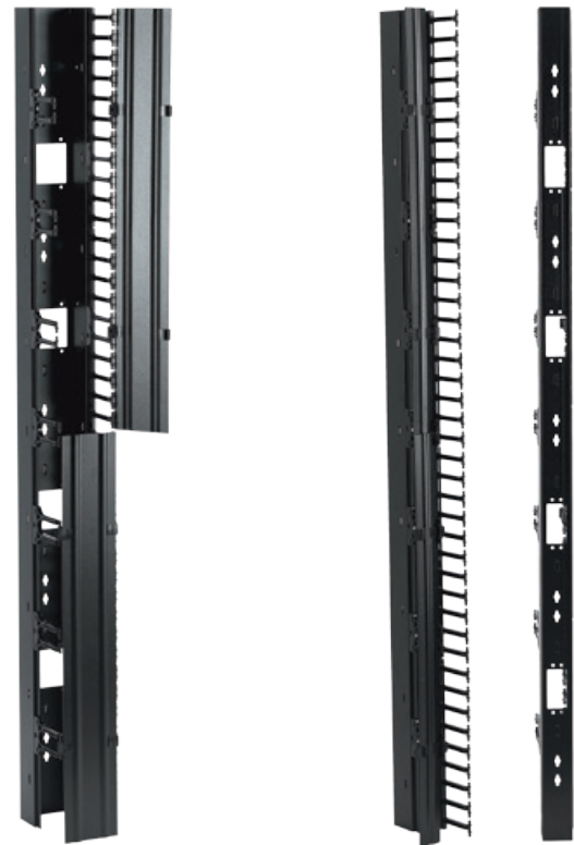
Vertical Cable Manager with cable fingers and door assembly.