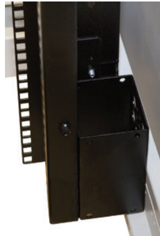
Vertical Cable Manager bracket installed (front view).