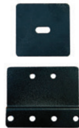
The cable managers install using a two piece bracket assembly.