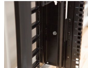
Vertical Cable Manager bracket installed (back view).

To contact an Eaton salesperson or local distributor, please visit Eaton.com/wrightline or call 800.225.7348