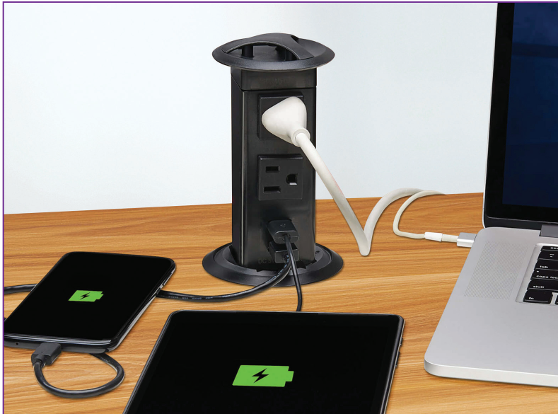
Designed to unite form and function, Safe-IT surge protectors and power strips are suitable for powering and charging electronics in professional environments.