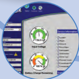
PowerAlert Data-Saving Software