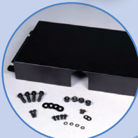
Multiple Mounting Hardware Kit