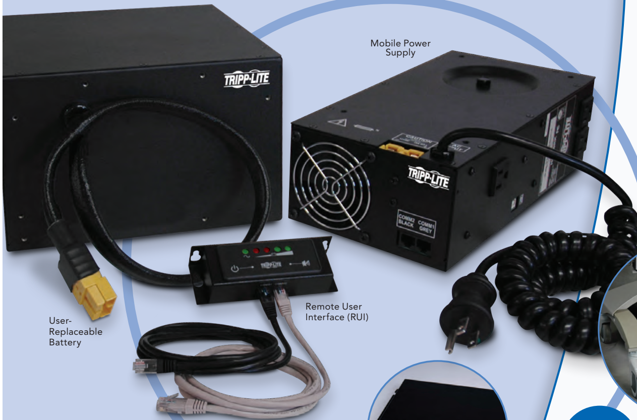
Mobile Power Supply