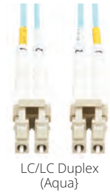
LC/LC Duplex (Aqua)