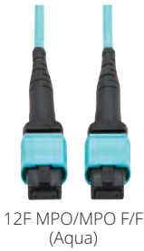
12F MPO/MPO F/F (Aqua)