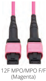
12F MPO/MPO F/F (Magenta)