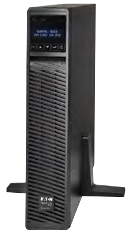
Mount the UPS in a rack or use the included tower stands for vertical placement.

Eaton provides free product support via phone, email or chat. If you have a question or need to find a replacement battery, Eaton can help.