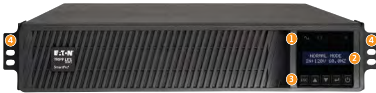
Model SMART2200RML2U shown