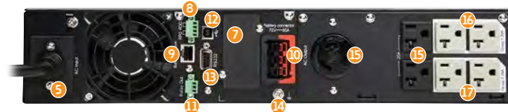
Model SMART2200RML2U shown