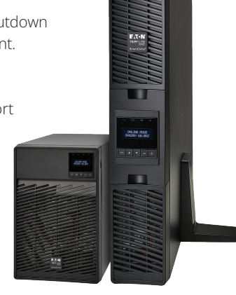
Choose a tower or rack/tower UPS to protect distributed IT equipment. Rack/tower UPS includes tower stands for vertical placement.

Eaton provides free product support via phone, email or chat. If you have a question or need to find a replacement battery, Eaton can help.