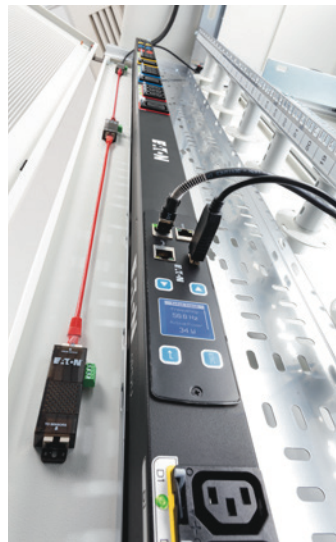
Eaton EMP Gen 2 daisy chained on rack PDU