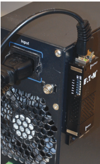
Eaton EMP Gen 2 installed on UPS

1. Due to continuing improvements, specifications are subject to change without notice.