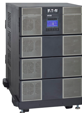
8-slot cabinet is scalable to 16 kVA in a 14U cabinet