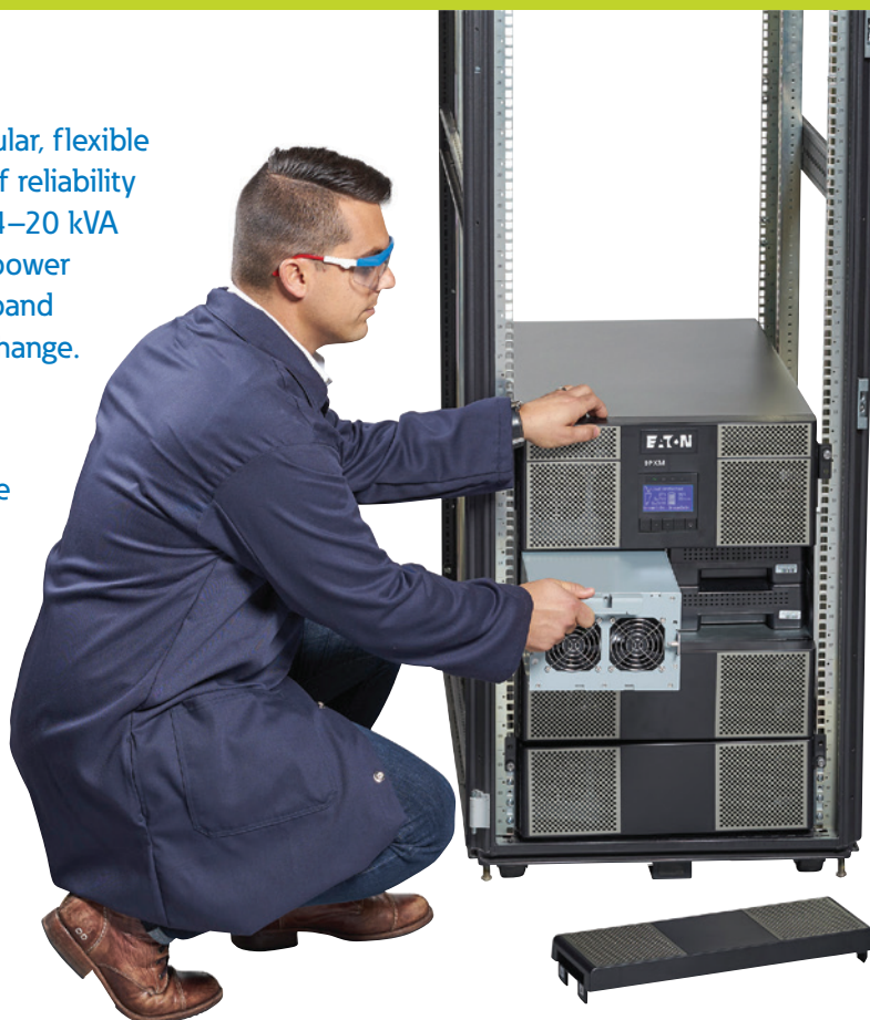
Easy hot-swappable power and battery modules

The plug-and-play power and battery modules are user replaceable so you can add them as needed without a service call or having to put a redundant system in bypass. With its low initial investment, online double-conversion technology, Eaton ABM® technology and high efficiency mode, you never have to compromise reliability for efficiency.