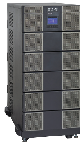
12-slot cabinet is scalable to 20 kVA (N + 1) in a 21U cabinet