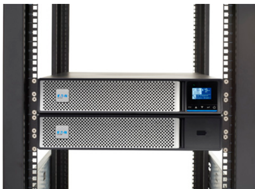
5PX G2 4-post mounting kits are rated (ISTA 3E) to support the weight of a UPS/EBM when mounted in a rack and being transported