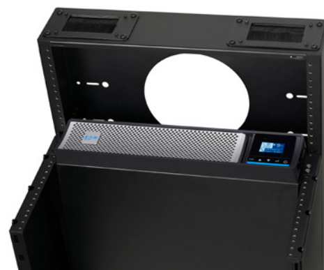
5PX G2 UPS mounted vertically in the MiniRaQ by Eaton, perfect for confined places