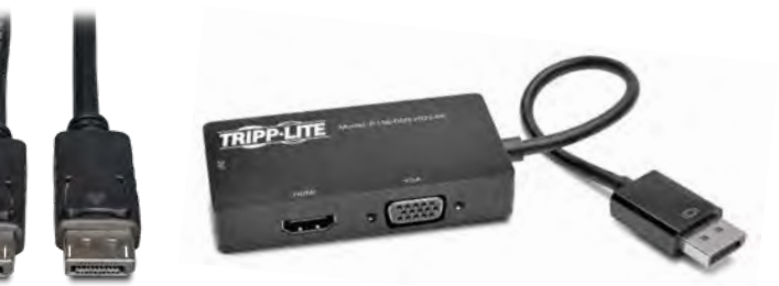
DisplayPort Cable with Latches