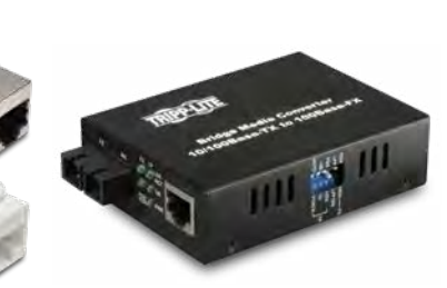
Multimode Media Converter